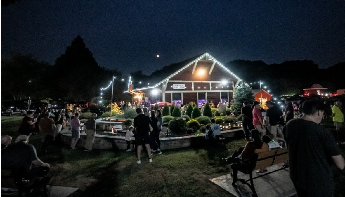
People driving by, stopped in at the sight of this Railway Society event.

The Boothe Memorial Park Railway Society recently hosted an evening of excitement at their train museum. On Friday night, September 5 th , hundreds of visitors came to view the outdoor trains as they whistled under bridges and through tunnels lit by subtle street lights on the life-like platform outside. Inside the Railway building, the trains chugged along through all the various settings, from floor to ceiling, whistling all the way. The trains were mesmerizing for the children, and captivated the adults as well.