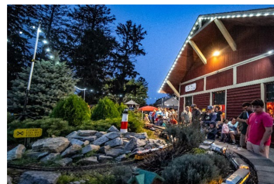
Close-up up of the outdoor scene.

Photos in this issue are courtesy of Rod Jovanelly - A Touch of Color