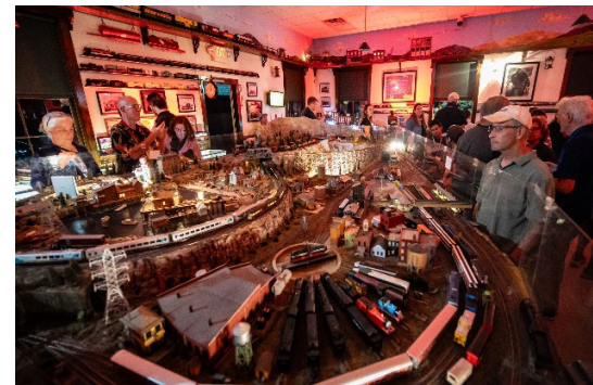
Inside view of the Train Museum

The weather cooperated beautifully, and brought many visitors for yet another amazing event at Boothe Memorial Park.